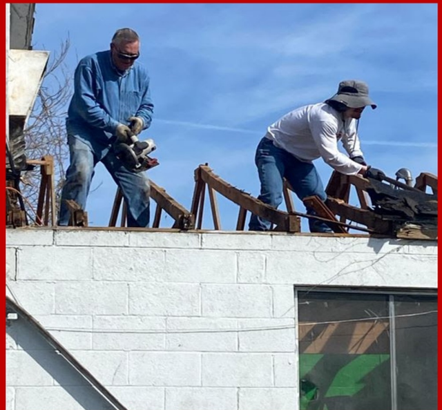
Central College students leading youth outreach activities and working on a building improvement project on campus.