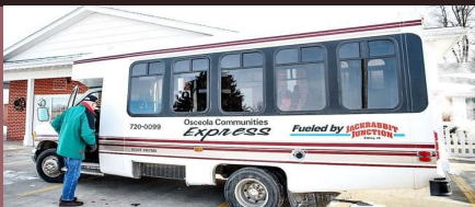
Osceola Communities Express