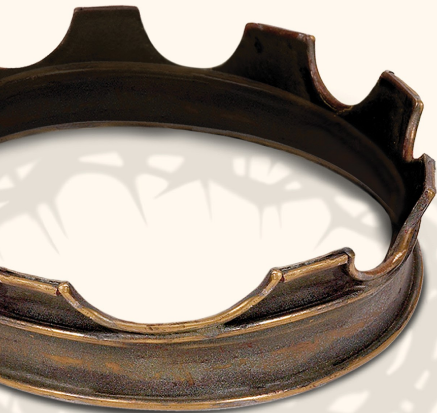
The Trials of a King