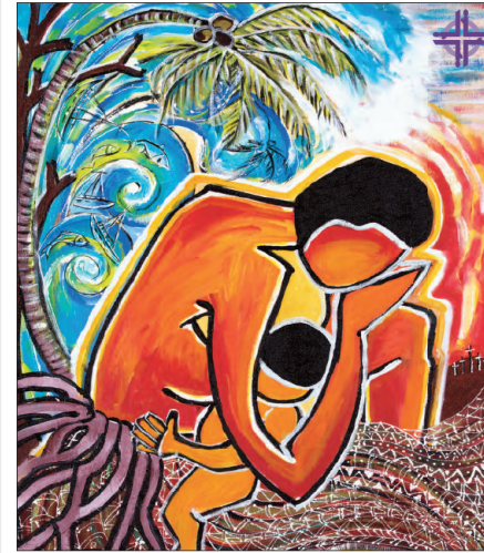
World Day of Prayer • March 5, 2021